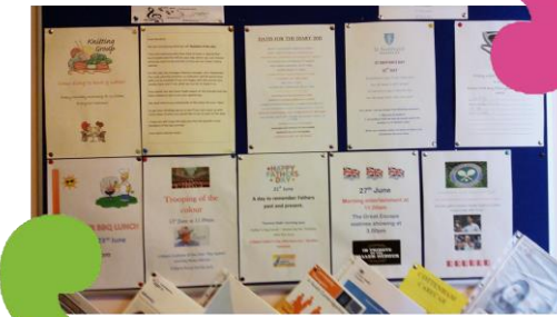
Information in corridor

The lounge area is light and spacious, with large windows looking out onto the gardens and patio areas. The Manager's office and hair salon are located adjacent to the lounge.